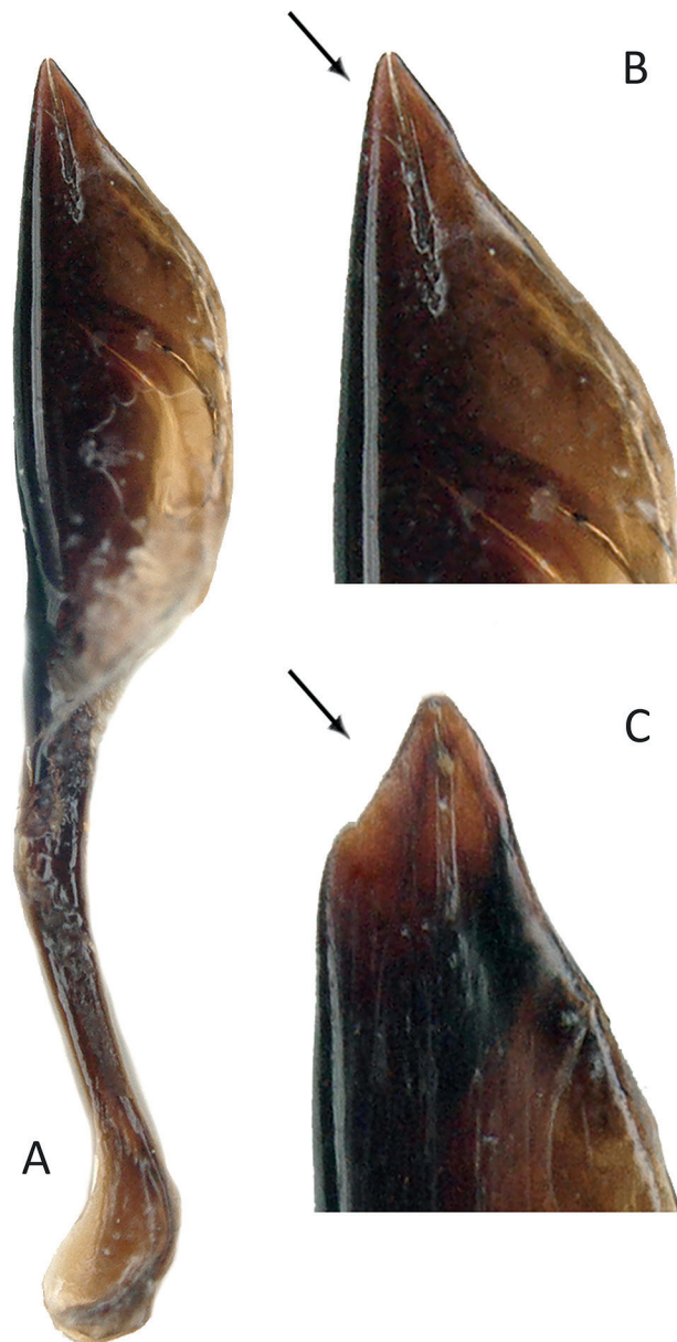
Figure 1. The apodeme of adult female Phlyctinus (a), with a straight tip typical of most species in the genus, including P. callosus (b); only P. xerophilus having a sloping tip (c), paratype shown here

Historical and recent (post-2000) distribution records of P. callosus and P. xerophilus are generally similar (Figure 2; Suppl. Material 1), with more extensive records being obtained post-2000 thanks to recent intensive field work. There is evidence of human mediated transport of both species outside their natural distribution ranges in southern Africa (Suppl. Material 1). Phlyctinus callosus seems to be the only Phlyctinus species to have been established outside of southern Africa, specifically in different areas of Oceania, St. Helena Island and Réunion